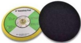
6inch 150mm M8 screw thread